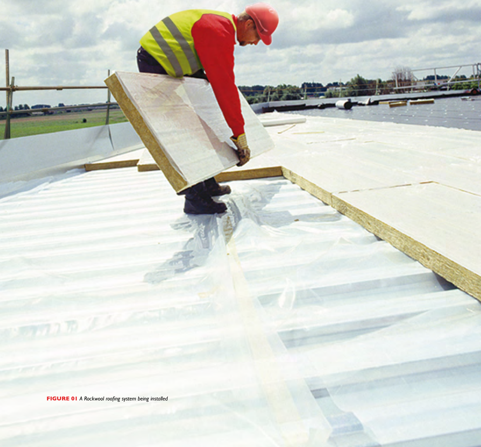
FIGURE 01 A Rockwool roofing system being installed