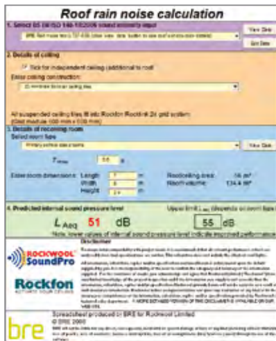
FIGURE 07 Screenshot of the BRE/Rockwool rain noise prediction programme

A tank positioned above the test roof is filled with water and constantly recharged. The flow rate is calibrated and monitored to ensure a correct rainfall. Sound pressure level measurements are taken below each roof or roof/ceiling construction in the frequency range 100Hz to 5kHz. The rain noise standard describes various types of artificial rainfall that can be used, as shown in Table 2. Real rain can be classified in terms of rainfall rate, typical drop diameters and fall velocities. The artificial rainfall parameters that affect the noise generated by roof elements are controlled in the laboratory. At present, the intention is that 'heavy' rainfall shall be mandatory for the comparison of products and solutions.