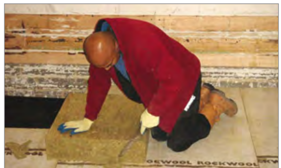
FIGURE 02 Rockwool Hardrock being laid on vapour control layer

Designers can be confident in the use of this data and the constructions used, compared with any other previously obtained data and any subsequent predictions in accordance with previous draft or ad hoc standards and laboratory set-ups. When looking for data and making comparisons for designs to resist the negative effects of rain noise, it is prudent to ensure that the test results are current and obtained in accordance with the published standard. The solution put forward should be straightforward and easy to construct. A BRE report from January 2008 contains all the test data and results. Further details are available from Rockwool Rockfon.